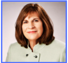
Hon. Mae A. D'Agostino U.S. District Judge Northern District of New York

Judge D'Agostino will talk about observations from her time as a medical malpractice defense attorney, and now, presiding over those cases from the bench. She will discuss changes in the system related to the pandemic, and those that continue to effect litigants, jurors, and the overall system. The judge will also identify frequent issues that arise in medical malpractice cases, along with pitfalls and strategies.